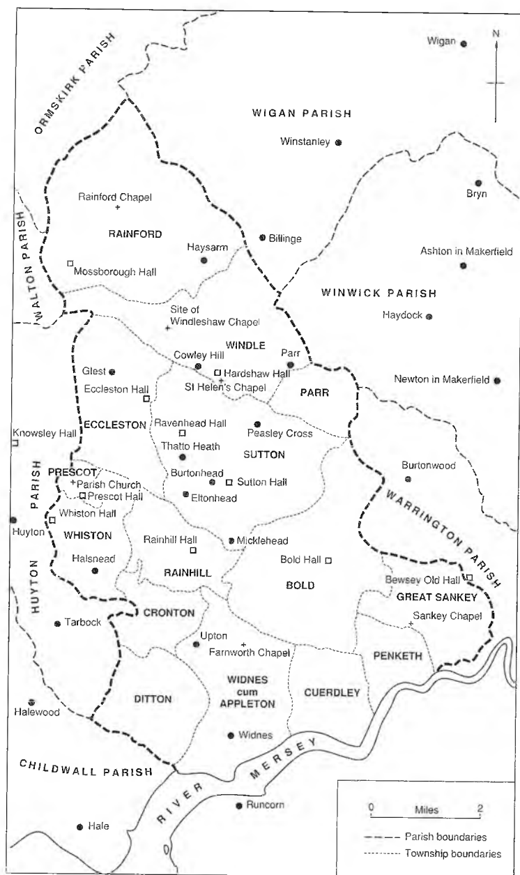
PRESCOT PARISH: with its fifteen townships