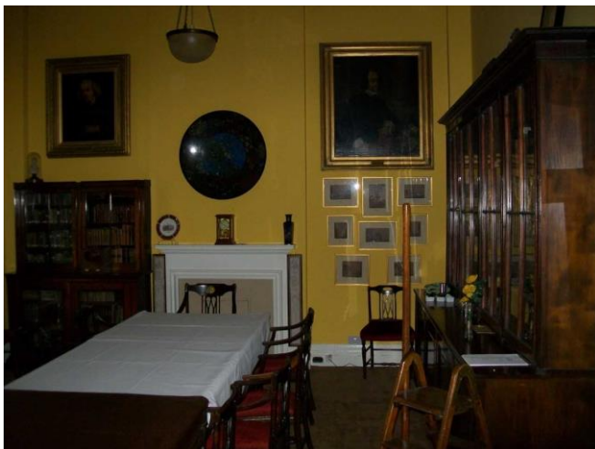
The Athenaeum Committee Room